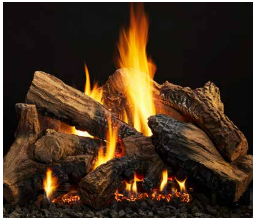
Duzy 5 - 24" Log Set