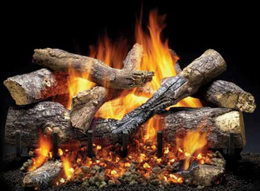
Grand Oak 24" 2-Tier Log Set

For larger fireplaces, the Fireside Grand Oak vented gas log set showcases 11-12 authentic logs from real oak timber molds. An ultramodern burner system creates a multi-level fire. The Outdoor version has such a beautiful fire, friends may ask if they can add a log to it. For gas logs with radiant burner technology, add outstanding realism with the Duzy 5's eight true-to-life ceramic logs, pushbutton ease and Natural Flame™ look.