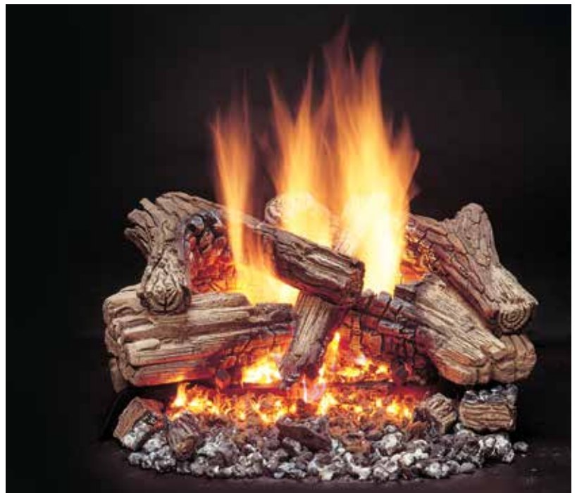
Duzy 3 - 24" Log Set