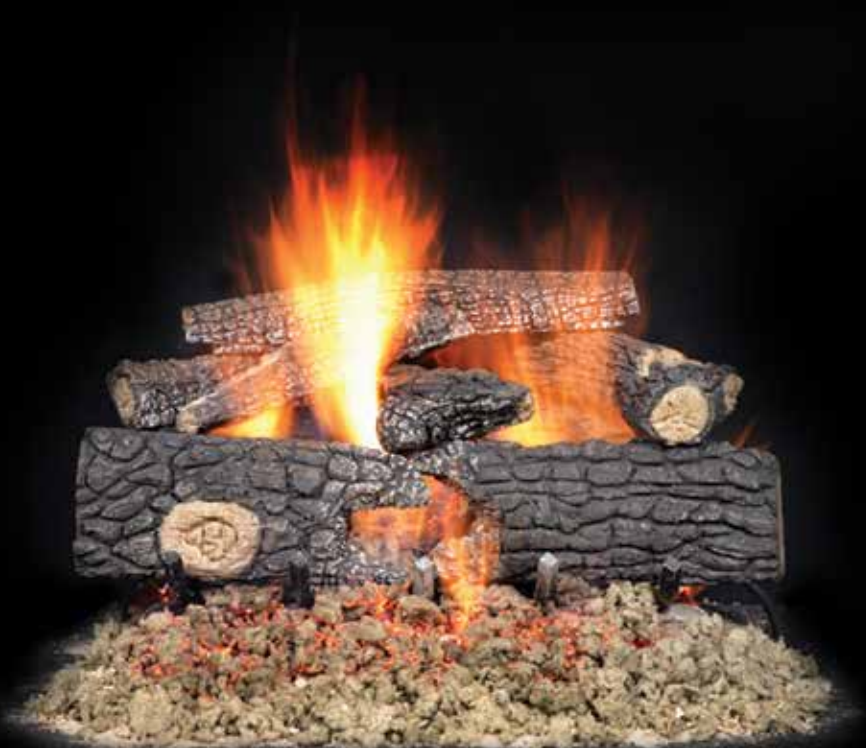
Fireside Realwood - 24" Log Set

Beautiful logs create a beautiful fire, but they don't have cost a lot. The Fireside Realwood gas log set adds bona fide appearance with eight detailed logs at a value price. An Outdoor model features a stainless-steel grate and burner elements to handle the elements. The Duzy 2 fits even narrow wood-burning fireplaces with four ceramic-fiber logs and our patented Natural Flame stainless steel burner, while the Campfire set recreates a natural look with 10-11 ceramic fiber logs.