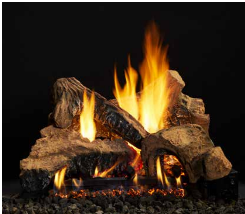
Duzy 2 - 24" Log Set