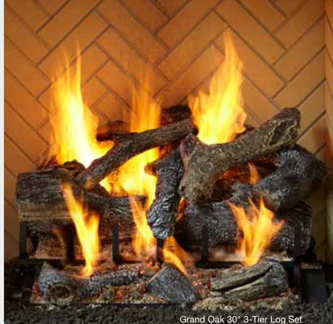
Grand Oak 30' 3-Tier Log Set

You get the look of a traditional, open-hearth fireplace plus the cleanness of gas with touch control. A gas log set doesn't overheat the room or require any change in the appearance or structure of your fireplace. Instead it delivers a realistic, room-enhancing fire at any moment, any day of the year.